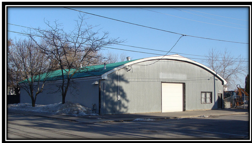
100 Prince Street, Deseronto

Camp Rathbun was home to two squadrons, and had accommodation for 53 officers, 246 cadets and 330 other ranks. It straddled the Boundary Road at the eastern end of town, with hangars and the airfield on the western side of the road, and barracks on the eastern side. The hangars had sliding doors at both ends for ease of access and exit by the aircraft. Tall windows along the side walls allowed plenty of daylight into the structures, in an era when electric light was less prevalent (and very expensive). One of the hangar buildings survives at 100 Prince Street, Deseronto, where it is currently in use as a storage facility for the Town of Deseronto's Public Works Department.