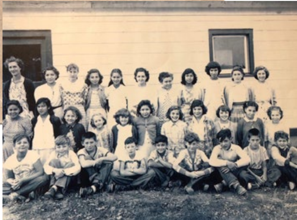
This picture is from the Eastern School circa 1948.

We, the Research Dept. would like to know who these students are.